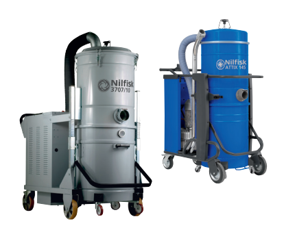
THREE-PHASE WET AND DRY