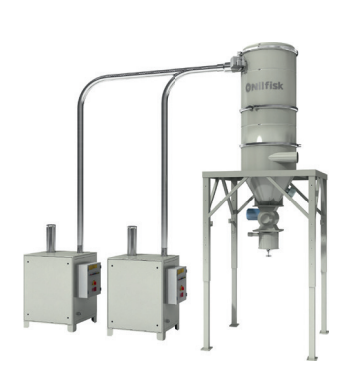
CENTRALIZED VACUUM SYSTEMS