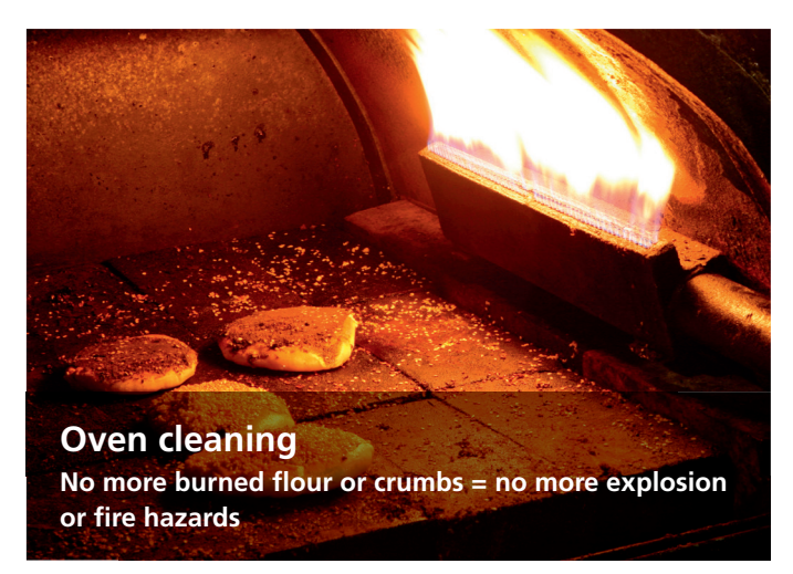
Keeping an oven in a perfect condition improves product quality