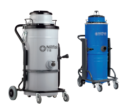
SINGLE-PHASE WET AND DRY