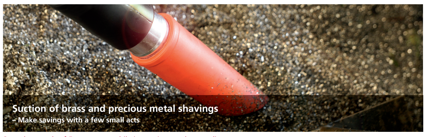
Save thousands of Euros a year while increasing product quality