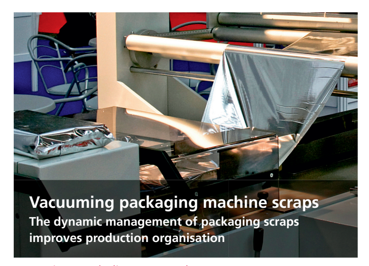
More time to dedicate to work