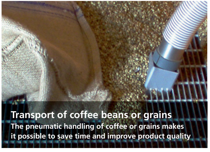
Maximising automation improves the manufacturing flow