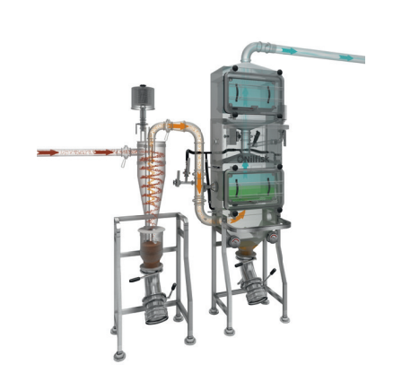
DUST CONTAINMENT SYSTEMS