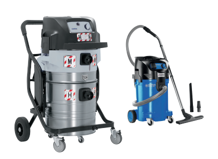
HEALTH AND SAFETY WET AND FRY