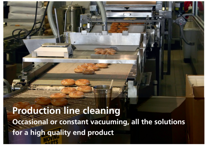
Eliminating waste means preserving product quality