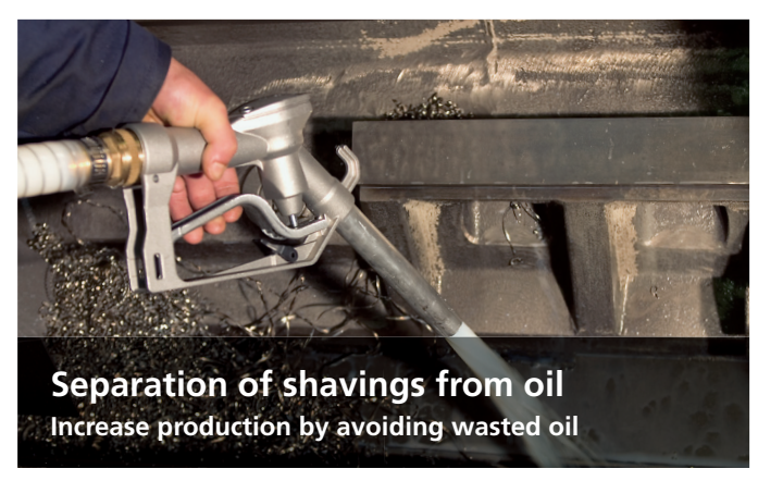
Using the OIL series means saving around 5 hours each time the tank is cleaned