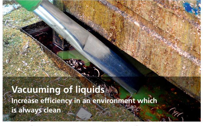
With Nilfisk liquid vacuums, 100 litres of liquids can be vacuumed and filtered in a few seconds