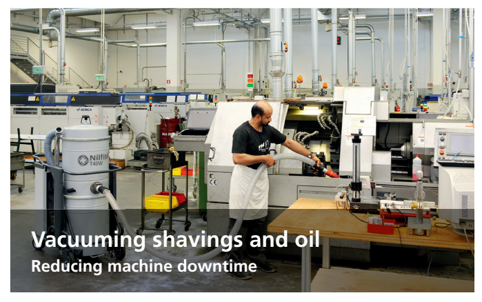
Using industrial vacuums can save you up to 200 hours of machinery downtime per year

Industrial vacuums are the perfect complement to mechanical production – they allow maintenance to be performed on machine tools, allowing time and resources to be saved.