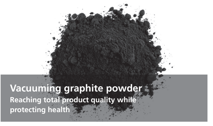
The dual benefit of eliminating environmental dust and recovering waste